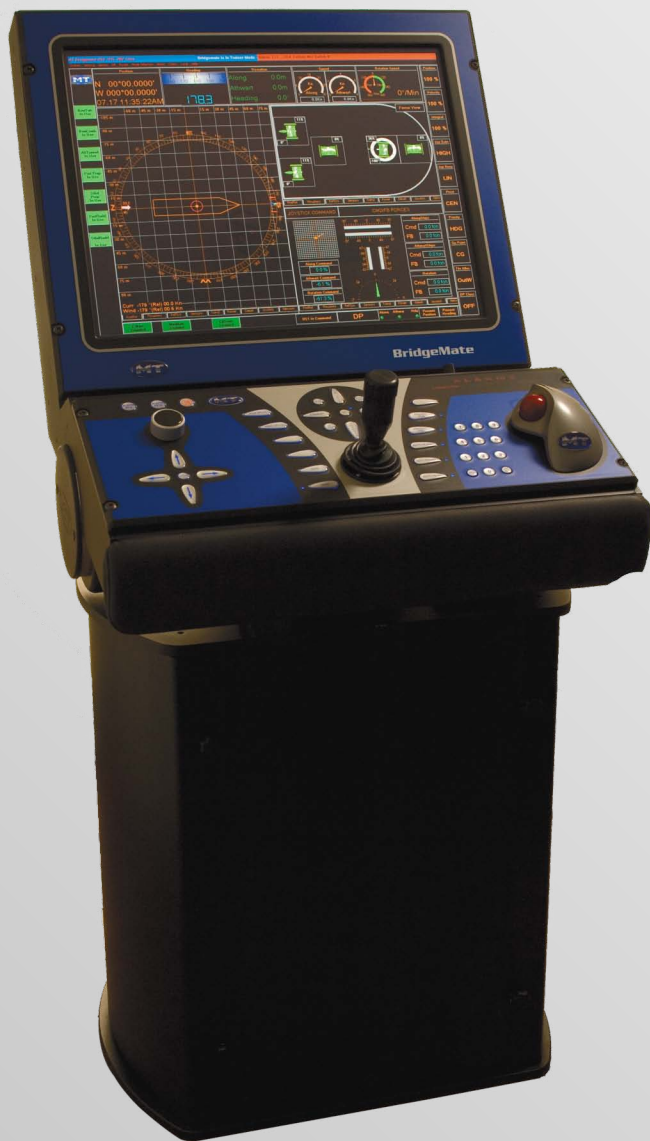
BRIDGE MATE DP 0 CONSOLE VERSION